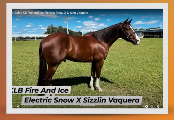
Horse For Sale | KB Fire and Ice Electric Snow X Sizzlin Vaquera