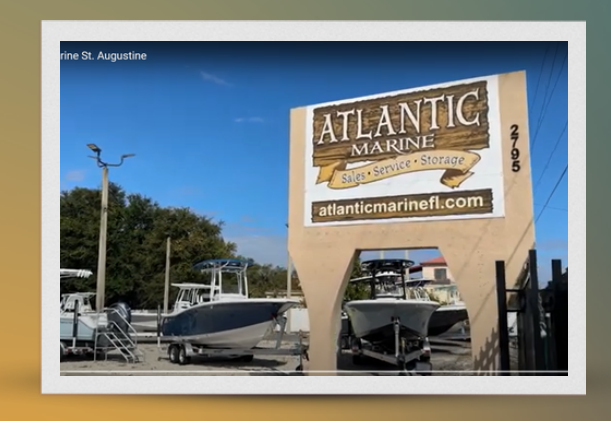
Atlantic Marine St. Augustine