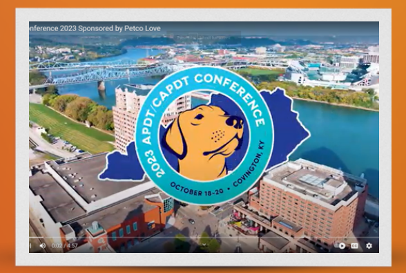
APDT Conference 2023 Sponsored by Petco Love