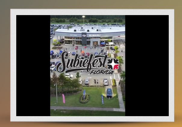
Subaru Subiefest Pre Party 2023