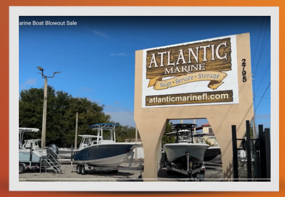
Atlantic Marine Sale Commercial