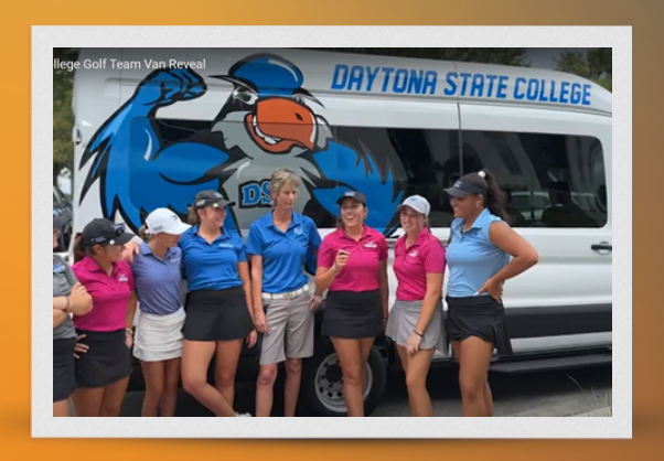
Daytona State College Golf Team Van Reveal